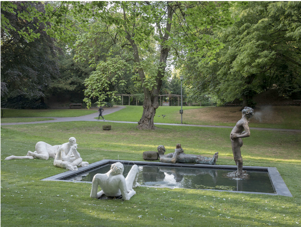
Nicole Eisenman, Sketch for a Fountain , 2017.

Boston. An earlier version titled Sketch for a Fountain (2017) was a hit with the public (and vandals ) when it premiered at the 2017 edition of Skulptur Projekte Münster. The sculpture features several figures situated in various leisurely postures around a shallow pool of water. In the initial Münster version, the figures were made of both bronze and plaster, but in the new iteration they will all be bronze. The new installation will be unveiled on June 2nd at a complex dubbed 401 Park—a former Sears & Roebuck Company building in Fenway that is being revamped by local developer Samuels & Associates. Eisenman's sculpture will be the centerpiece of a 1.1-acre park at the development that will be open to the public.