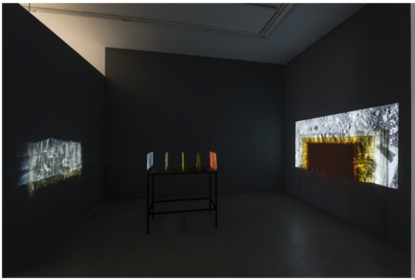
Rosa Barba, "The Color Out of Space"